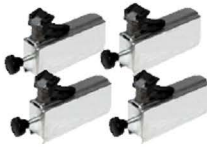
Clamp Extensions 100012100