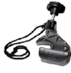
Hand Free Clamp 0604065