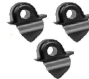
Front Insert Z63905900