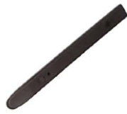
Bead Lifting Lever Cover C00A000017