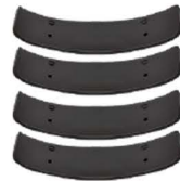
Bead Breaker Cover Z456887A