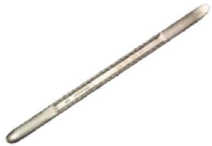
Bead Lifting Lever 511242