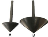
Centering Cones A: Z067901600 B: Z3-90295